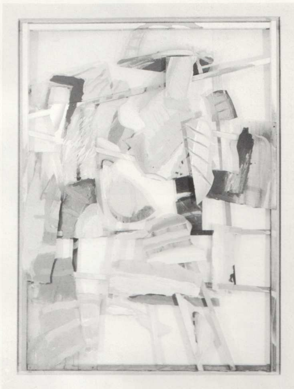
cat. no. 36

Born in Dunfermline 1958. Diploma and Post Graduate in Drawing and Painting at Duncan of Jordanstone College of Art, Dundee 1979-84. Hospitalfield Summer School, Arbroath 1982. S.E.D. and Greenshields travelling scholarships in Italy, Holland and Belgium 1983. One Artist Exhibition: Traverse Gallery, Edinburgh 1984. S.A.C. Lithograph bursary 1985.